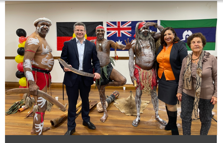
Celebrating NAIDOC week at Kingsgrove Community Aid Services